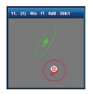
Fig. 3: Graphical presentation of the test results

For monitoring the autofrettage process, we recommend the MAGNATEST D test instrument in conjunction with an encircling test coil for determining the material properties of the test piece. This application solution enables continuous quality monitoring of the production process or an incoming gooods inspection. Further information about our products and industry solutions can be found on our homepage at: foerstergroup.de