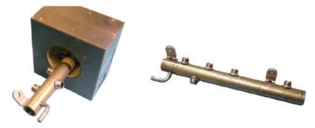
Fig. 2: Coil with test piece

In the series testing, all other measuring points are compared with the specified tolerance limits. The automatic sorting of the workpieces into good and bad parts takes place according to the respective test result.